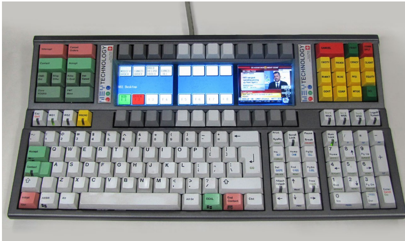
Multifunctional Keyboard MK06 with integrated TV solution

But traders at Canara Bank are also enjoying another value added feature on their MK06 Multifunctional Keyboards – TV streaming. Here, the MK06 keyboard display is also being used to stream business news, such as CNBC. Traders can observe relevant financial information and news without having to leave their desks or switch their screens.