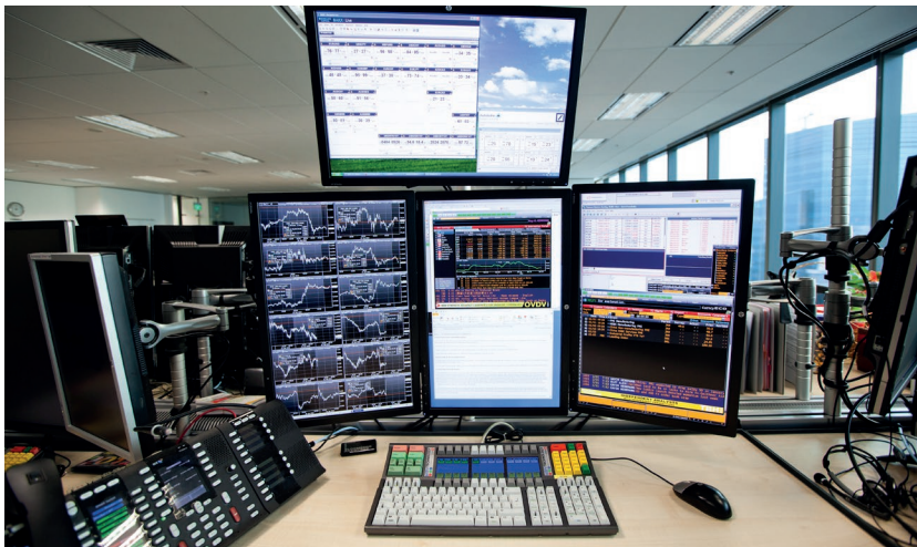
Modern workplace in Julius Baer's trading room in Singapore

Julius Baer's Asia Square trading floor is one of the most technologically advanced floors in Asia. Due to the WEY Solutions, traders work in a quieter and more comfortable environment which fosters high performance trading. Capture and Focus technology enable them to easily and intuitively control all the essential services,