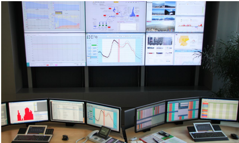
New clarity at TIWAG in Tirol, Austria

The Tiroler TIWAG AG provides safe and environmentally sound energy supplies at competitive prices. TIWAG also creates jobs, value and industrial development in its home market, contributing to the securing of positive economic and social living conditions for the next generation. In order to continually ensure a safe, inexpensive