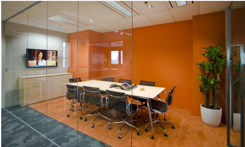
Conference room with smartTOUCH keyboard as control unit.