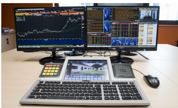
Different applications ...