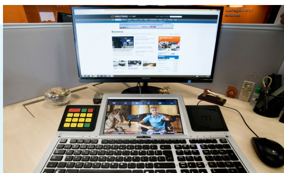
... at the push of a button.

without any operational downtime. The eight WEYTEC ultraFLEX miniPCs, which provide a high-performance computing power comparable to modern desktop PCs, only take up two 19" chassis, or 6U of rack space and consume approximately 300 watts of power in total.