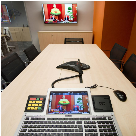
The screen of the WEYTEC smartTOUCH keyboard ....

Flexibility is a key benefit of WEYTEC's state-of-the-art solutions. In addition to utilizing a mini-trading facility complete with Bloomberg market data, investment advisors also use their WEYTEC smartTOUCH keyboards with the 10" colour touch screen to stream video and keep abreast of the markets by watching business TV. As always, all systems, screens and services can be controlled with a single WEYTEC smartTOUCH keyboard.