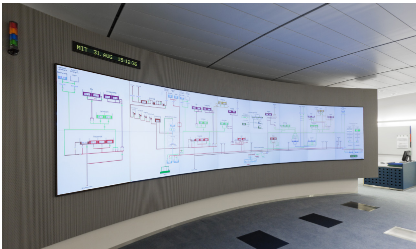
The video wall in daily use

The video wall can be conveniently controlled from any workplace using the Graphic Controller Netpix, which provides all the necessary signal inputs. In combination with the eyecon Wall Management software, all computer systems, applications and signals can be projected in any scale on any cube. This allows complete flexibility, a video wall configuration which is customised to exactly fit the requirements as well as a one-to-one representation of the dispatchers' workstation screens.