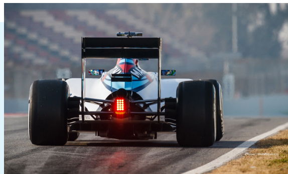
High performance solutions